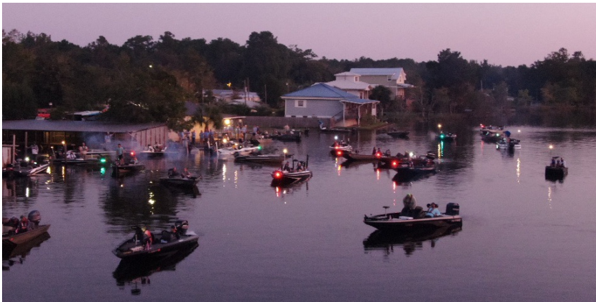
CHELCO's Charity Bass Tournament had more than 40 boat entries.

CHELCO and Southland Utility Services employees raised more than $5,500 to bring electricity to a remote village in Guatemala at the CHELCO Charity Bass Tournament held at Black Creek Lodge in October. Florida electric cooperatives, with the support of NRECA International, are teaming up to send crews to Guatemala sometime in late 2020. A huge thank you to all the employees, sponsors and participants who made the event possible.